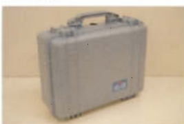
Carrying trunk case

Specifications and appearances are subject to change without notice.