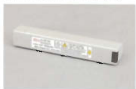
Spare Lithium Ion battery pack