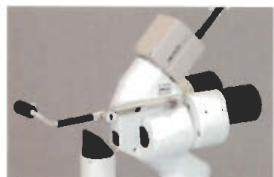
Main unit with video adapter